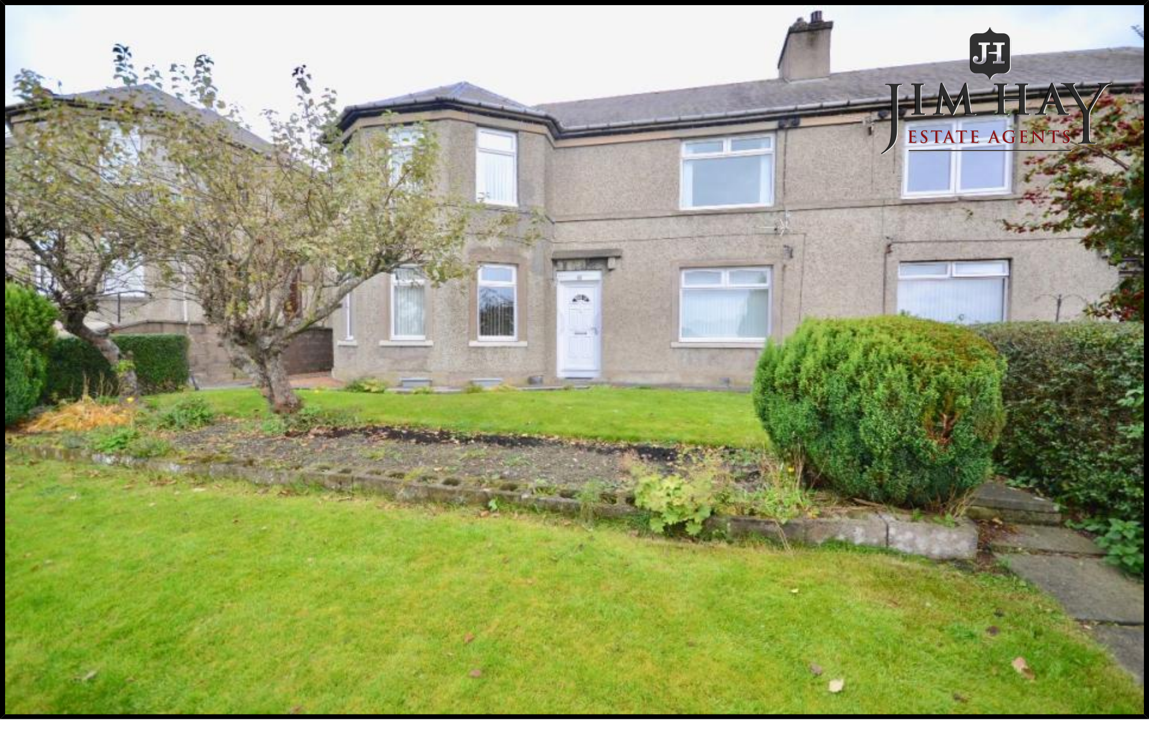
7 Twirlees Terrace Hawick TD9 9LP