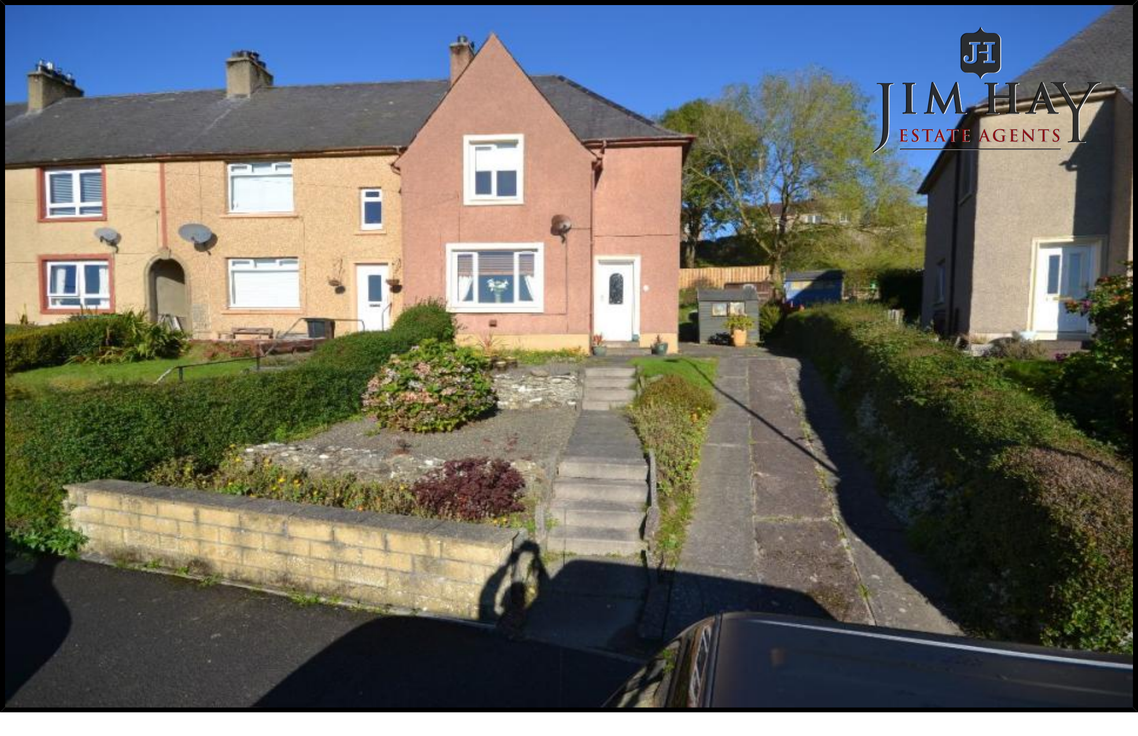
5 Ivanhoe Terrace Hawick TD9 8EE