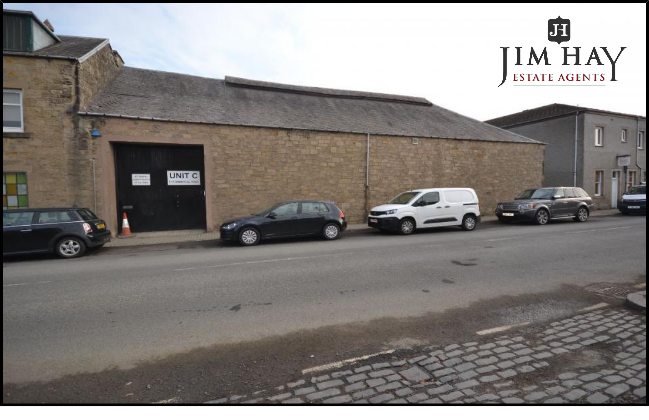
Unit C 17 Commercial Road Hawick TD9 7AQ