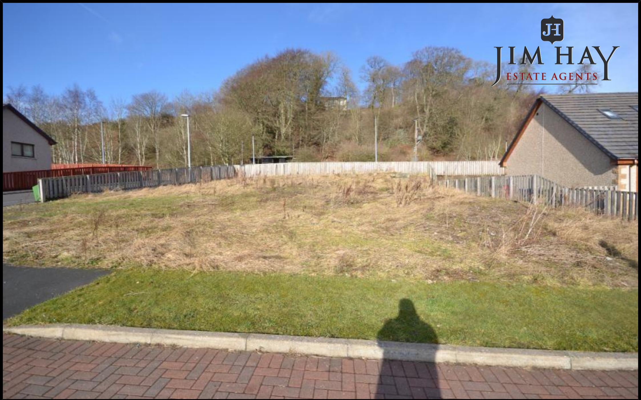
Plot No 1 Hislop Gardens Hawick TD9 8PH